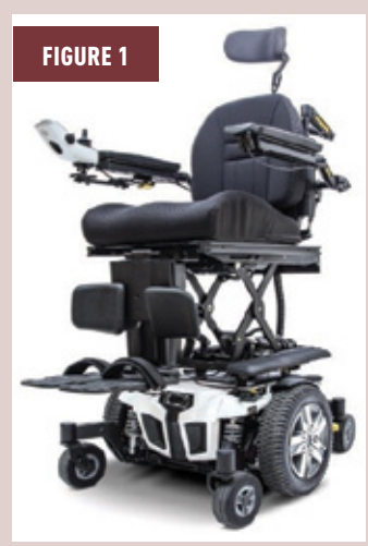
Power Adjustable Seat Height