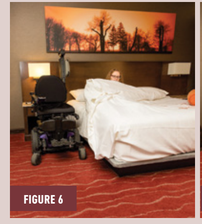
Stephanie stuck in bed 36 DIRECTIONS 2018.2

In the morning, she is unable to perform a sit-pivot transfer from her bed at 23 inches high to her wheelchair at 25 inches high, as it is an uphill transfer that she does not have the capacity to perform see Figure 6). Without the ability to lower the seat to 21," Stephanie is rendered bed-bound and subject to all the complications associated with that, such as muscle atrophy, increased risk of pressure injuries, pneumonia, bladder infections and malnutrition. By lowering the wheelchair seat height to 21," she is able to perform an independent sit-pivot transfer, minimizing the risk for UE damage or loss of balance (see Figure 7).