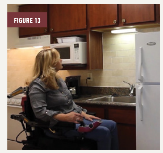
Madonna in her kitchen elevating to mitigate the number of times she must reach overhead.

Their study compared the frequency and duration of overhead arm activity between wheelchair users and occupationally matched non-wheelchair users during an eight-